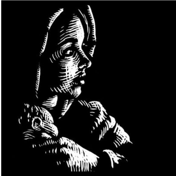
Mary, Mother of God

Catholic Community of East Hubbard County